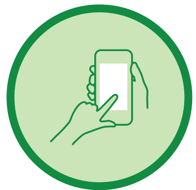
DOWNLOAD COVIDSAFE APP